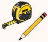
Tape measure Pencil