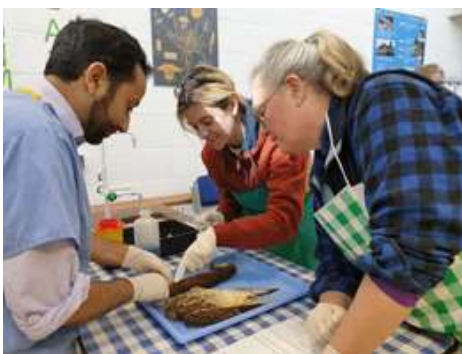
WRI Introduction to Wildlife Rehabilitation course