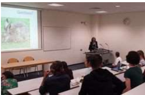
Liz Mullineaux UCD Lecture