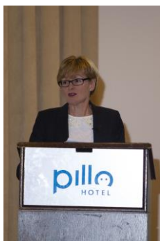
Mairead McGuinness MEP