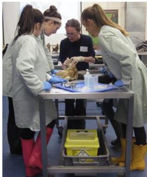
UCD vet students

"..sorry, but do we actually have many injured wild animals?"