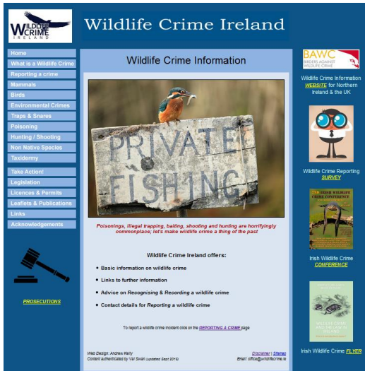
Wildlife Crime Ireland website