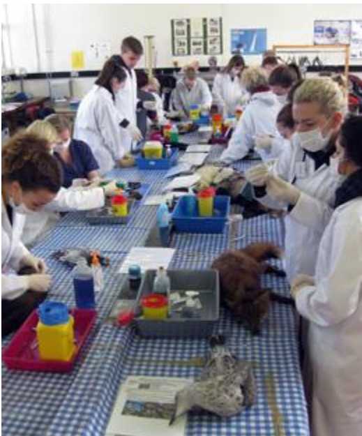
IWRC Wildlife Course delegates

The International Wildlife Rehabilitation Council (IWRC) is the leading developer of professional training for wildlife care providers in North America and internationally.